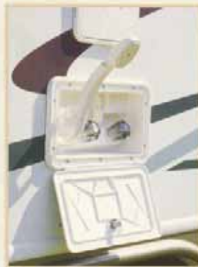
Centre: An exterior shower is a popular option.