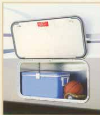
Right: Carpeted galvanized steel baggage compartments are lockable and afford complete protection for your valuables whether you're on the road or parked.