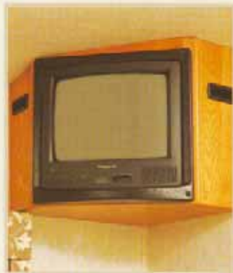
Left: To help you enjoy your leisure time, you can choose a remote control color TV for the bedroom.

In addition to the standard Embassy there is an optional XL package available on the A29, A31 and A34F models. This option provides you with three-season comfort. The thermal pane windows, lighted baggage compartments, enclosed, insulated and heated holding tanks and rear auxiliary heater make the Embassy XL impervious to spring and fall chills.