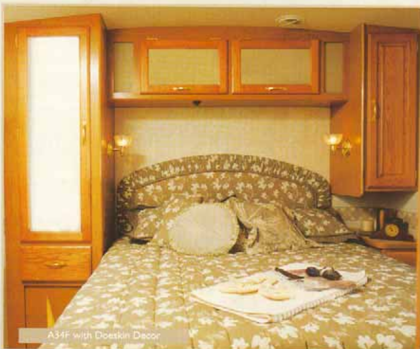
A34F with Doestkin Decor

When you choose the A34F Embassy with the slide-out, you add plenty of extra living space. Extra storage provided by the convenient slide out pantry in the galley is a real bonus.