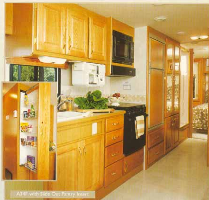
A34F with Slide Out Pantry Insert

Special attention given to driver comfort incorporates a large captain's chair and automotive style dash to make driving the Embassy enjoyable.