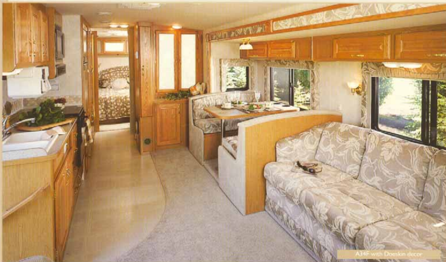
A34F with Doeskin decor

The Embassy 2001 is specifically designed to provide top-of-the-line value at an affordable price. You have your choice of four floorplan configurations from 27 feet to 34 feet in length - all with beautifully designed roomy interiors. The exterior is modern and features an eye catching graphics package complete with front and rear fiberglass masks. If you wish, painted skirts are an attractive option.