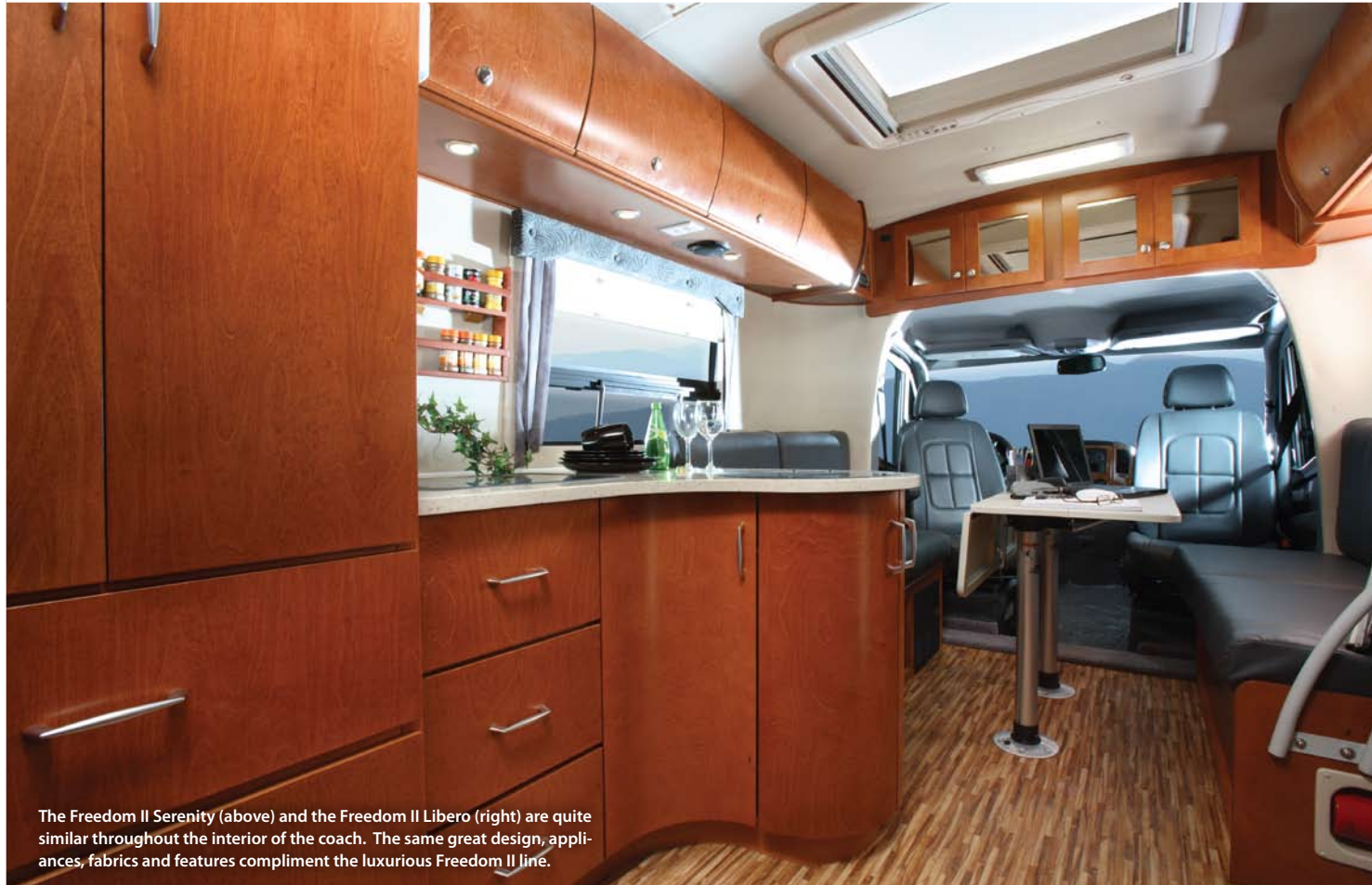
The Freedom II Serenity (above) and the Freedom II Libero (right) are quite similar throughout the interior of the coach. The same great design, appliances, fabrics and features compliment the luxurious Freedom II line.