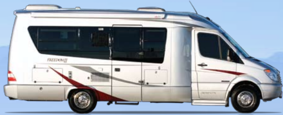
FREEDOM II SERENITY [diesel]