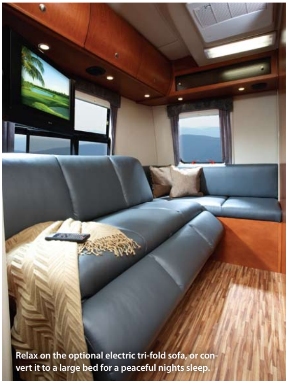
Relax on the optional electric tri-fold sofa, or convert it to a large bed for a peaceful nights sleep.

Superb interior refinement and irresistible charm have been combined with efficient use of interior space and a host of safety features to ensure that you will be ready to seek out your new journey, no matter where the destination. The Freedom II sets a new standard of construction and styling that surpasses all motorhomes on the market today. The fit, finish and quality that customers are accustomed to and recognize LTV as, have been the starting point for the Freedom II Serenity and Libero.