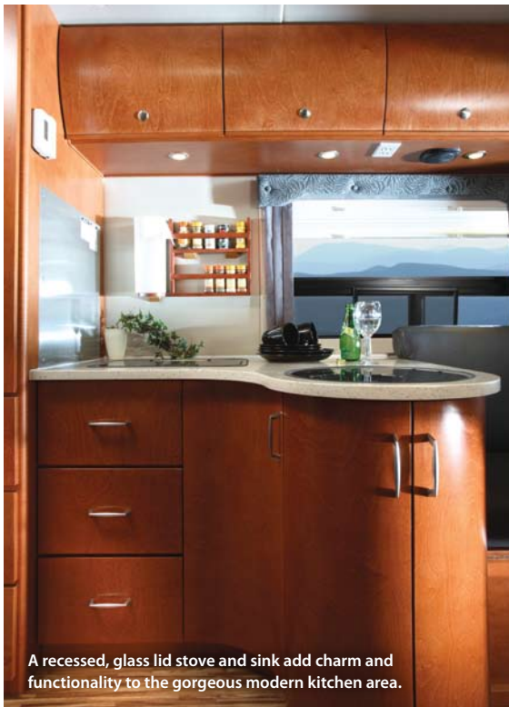
A recessed, glass lid stove and sink add charm and functionality to the gorgeous modern kitchen area.